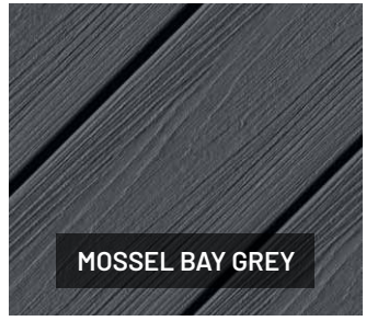
MOSSSEL BAY GREY